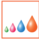
Piezo Variable Drop